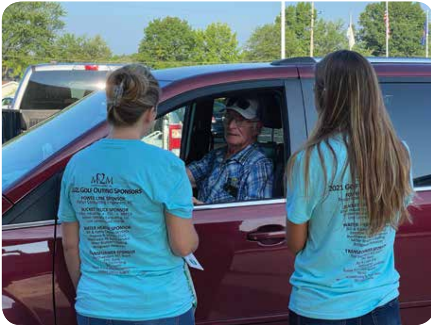
85th annual meeting in photos: All images are from the 2021 annual meeting, which took place on Saturday, Aug. 21, at the New Beginnings Church of God on Leslie Road in Meadville.

set long-term priorities for the co-op, also live locally on co-op lines. These board members have been elected by neighbors just like you. We know our members have a valuable perspective, and that's why we are continually seeking your input and encourage you to weigh in on important co-op issues and participate in co-op elections.