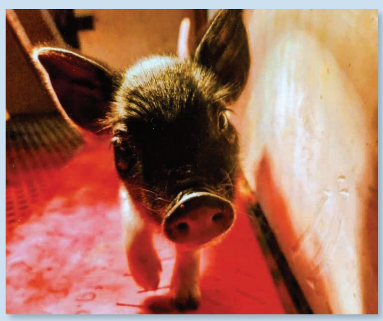
AMBER SENFT • VALLEY REC