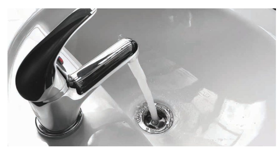
REDUCE WATER USE: With 35 Pennsylvania counties experiencing drought conditions, the state Department of Environmental Protection is asking residents of those areas to voluntarily reduce their nonessential water use.