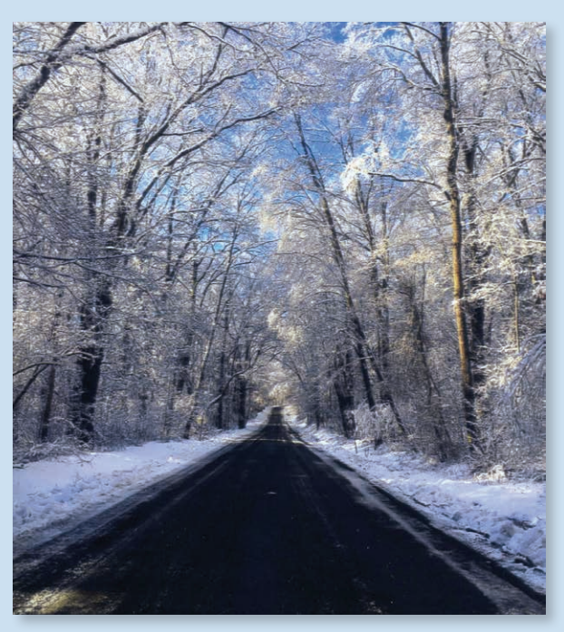
ELAINE FAHRENKAMP • WARREN ELECTRIC